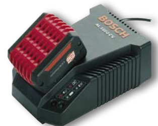
Charger and two batteries included