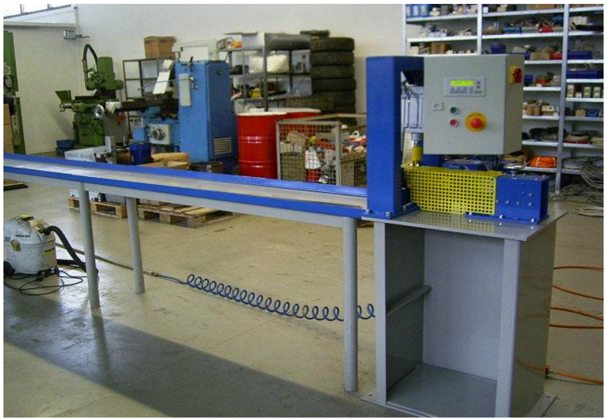
The MCTL, shown here with optional strap table, enables steel strapping or PET Polyester strapping to be cut to pre-determined lengths fully automatically. The unit is prepared for 16-32 mm steel strapping up to 1,6mm thick and PET strapping from 16 to 32mm width and a gauge of up to 1,3 mm