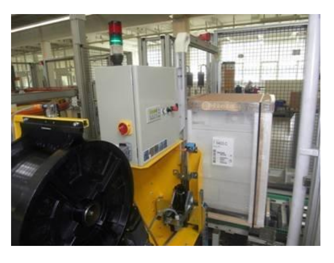
MH-V model in operation at the end of a packaging line securing packed appliance products