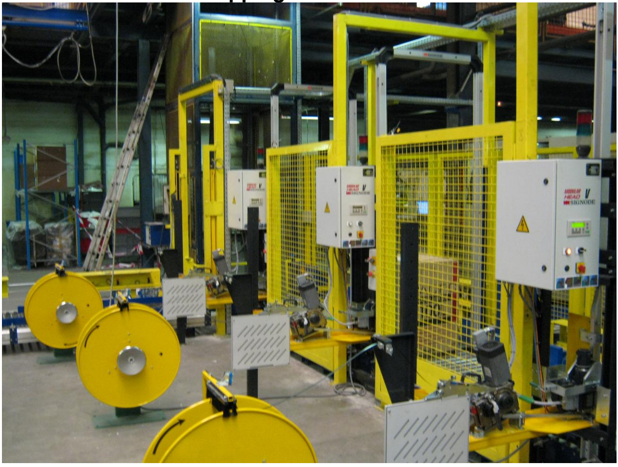
MH-V Side-Seal Machine shown in a high through-put production plant strapping packaged domestic appliances