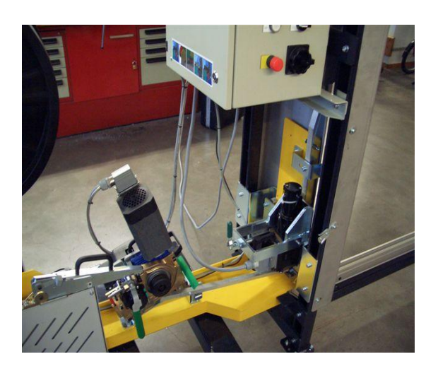
Easy access MH feed and take up and MH Strap sealer module on MH-V model