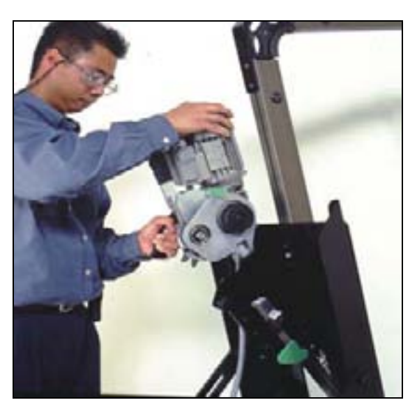
Copier technology - intuitive understanding & simplicity Easy access to strap channel for operators. The feeder unit rarely has to be changed and only weighs 12,5 kg

The company reserves the right to make technical changes without prior notification