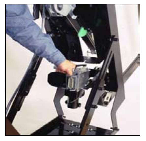
Simple to change the light-weight modules. The sealer weighs only 10 kg so can be changed in less than a minute by anyone